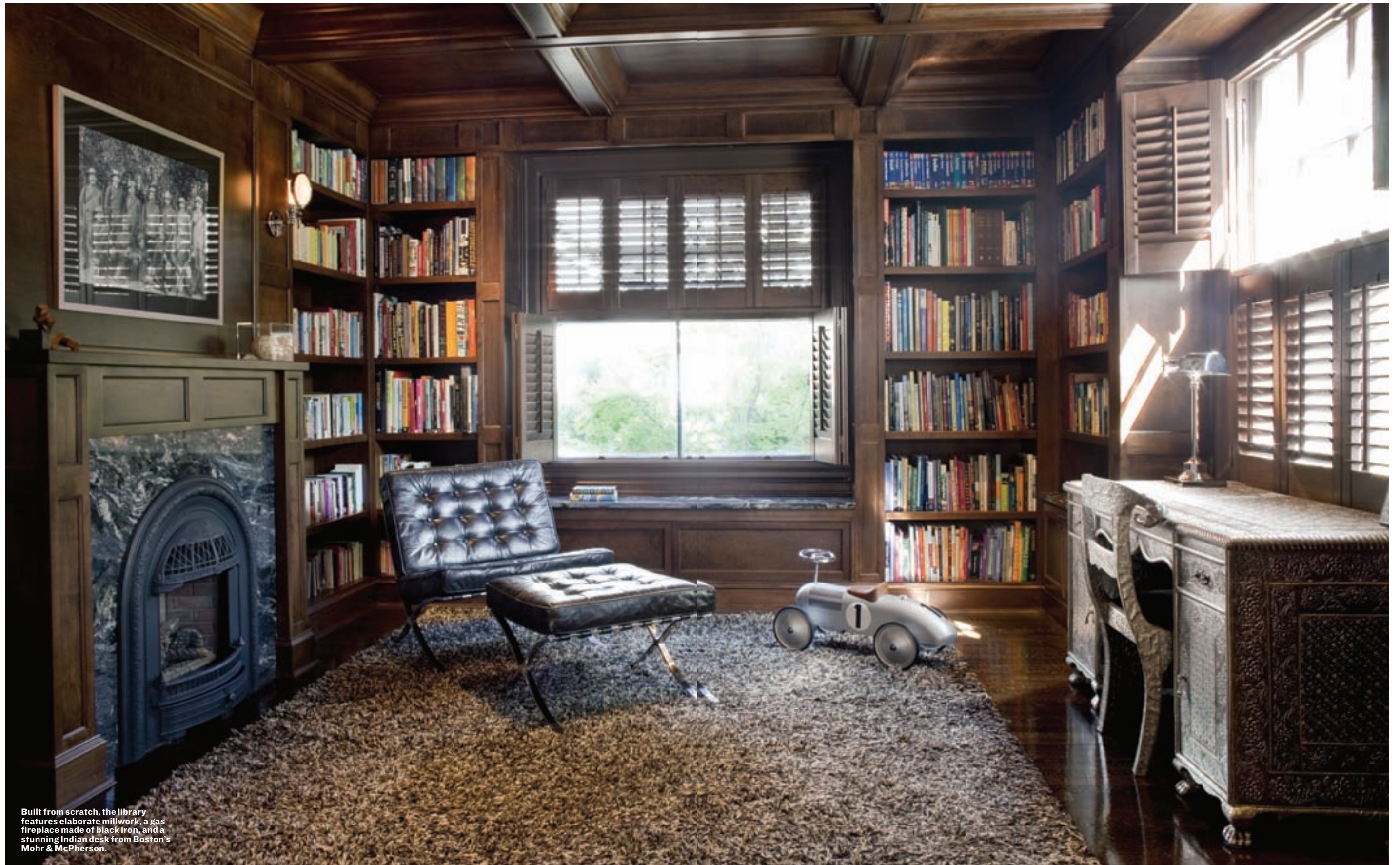
Built from scratch, the library features elaborate millwork, a gas fireplace made of black iron, and a stunning Indian desk from Boston's Mohr & McPherson.