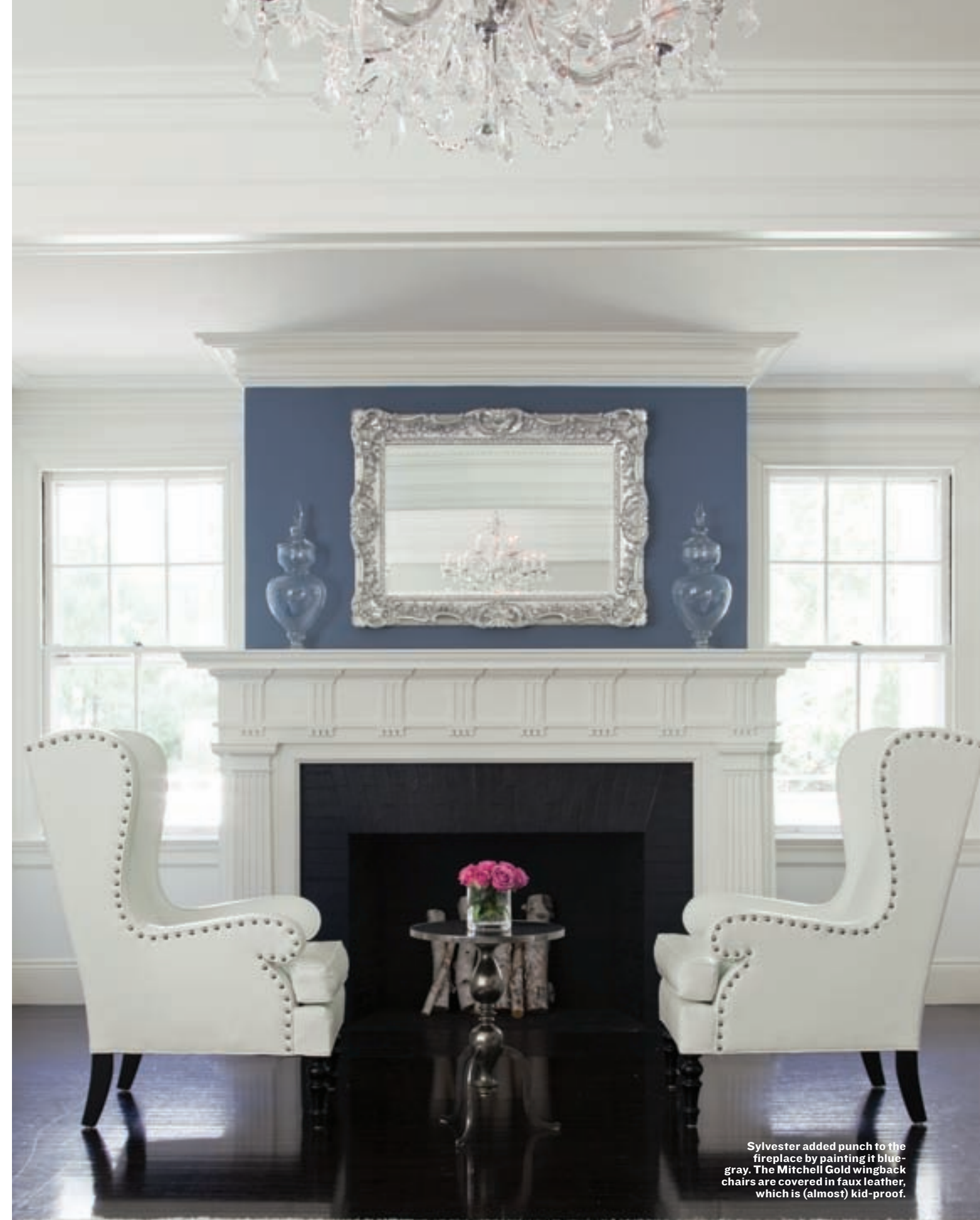
Sylvester added punch to the fireplace by painting it blue-gray. The Mitchell Gold wingback chairs are covered in faux leather, which is (almost) kid-proof.