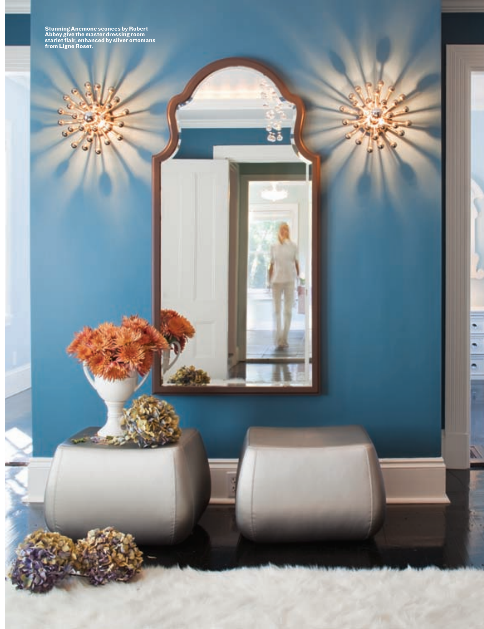
Stunning Anemone sconces by Robert Abbey give the master dressing room starlet flair, enhanced by silver ottomans from Ligne Roset.